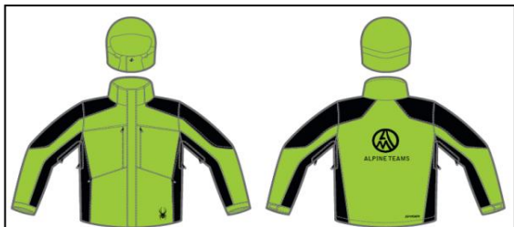
Race Ski Team Jacket Image